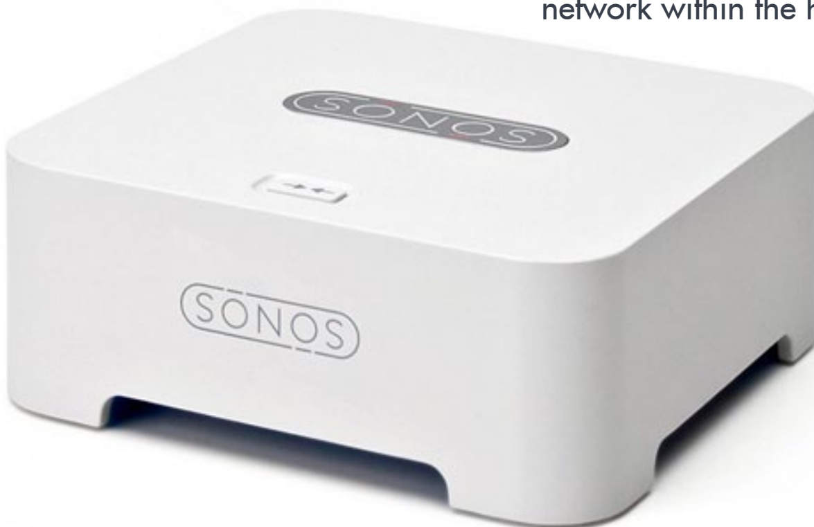
SONOS BRIDGE $49

The BRIDGE allows you to place the PLAY Series in a location that does not have a router or ethernet cable. The system is based on a wireless mesh network. The PLAY products and CONNECTs are mesh "nodes." The products communicate across this network, through the separate nodes. By adding the BRIDGE and each PLAY product, you are extending your network within the home.